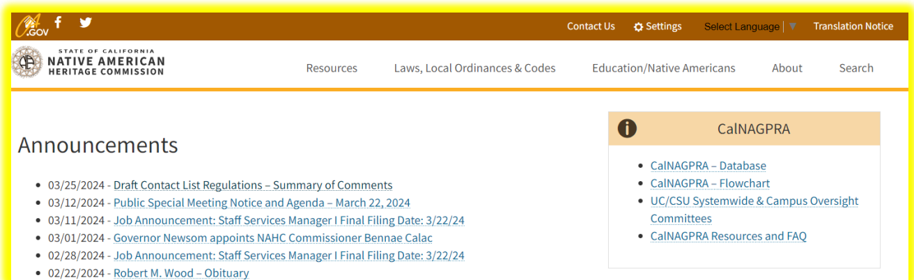
Figure 4. NAHC Homepage / CalNAGPRA