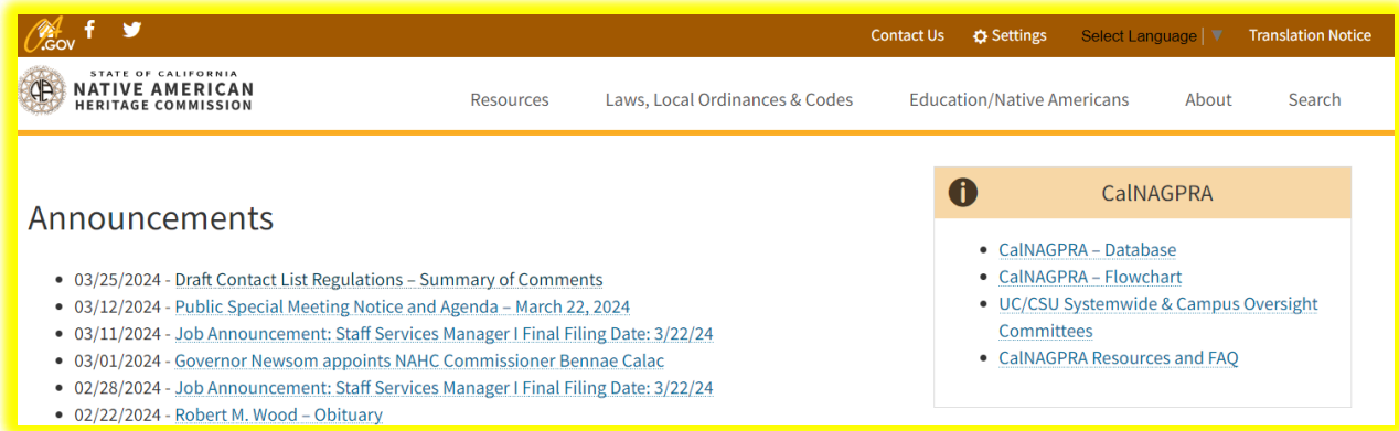
Figure 4. NAHC Homepage / CalNAGPRA

process. Currently, Mario Pallari has created a CalNAGPRA Flow Chart outlining an easy step by step process for Repatriation which can be found on the NAHC Website Homepage , CalNAGPRA Tab, “CalNAGPRA Resources and FAQ” Tab ( Figure 4 ).