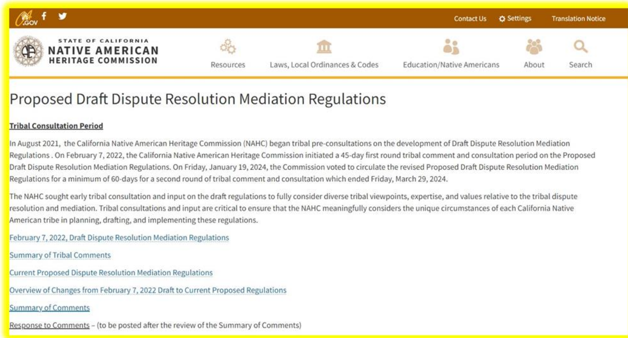
Figure 3. Draft Dispute Resolution Mediation Regulations