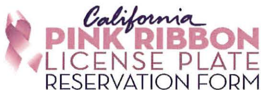
PLATE TYPE: (Annual Renewal fees are lower and will be paid directly to the DMV)

Hard copy application form to download and mail with payment. Please note fees displayed are outdated!